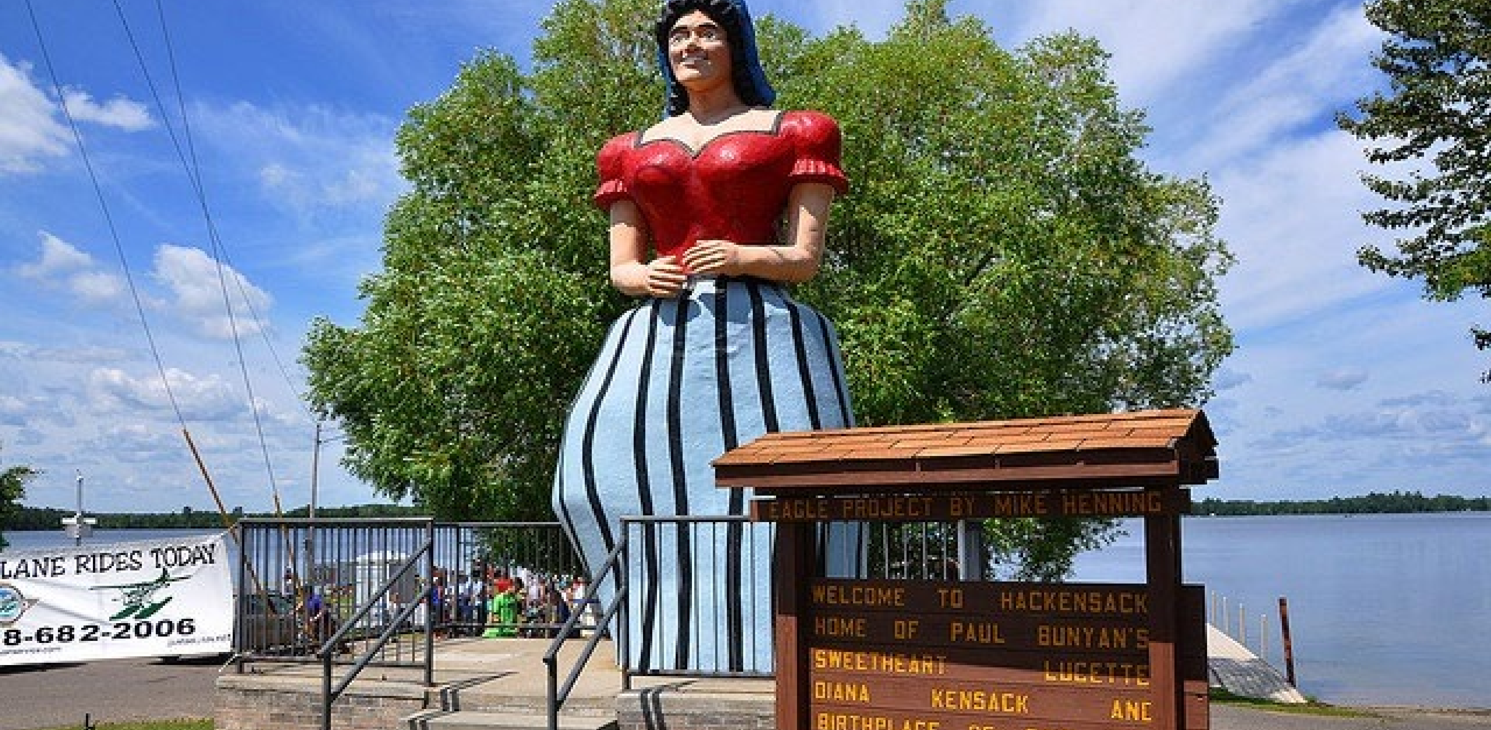
Hackensack Comprehensive Plan Public Kickoff Meeting